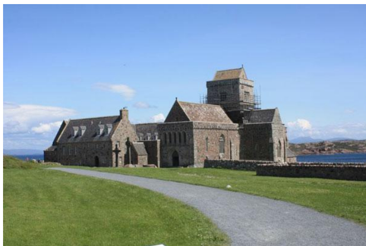
Iona Abbey

The Church Buildings Renewal Trust is a Scottish charity concerned with maintaining church buildings in active use once regular worship has ceased. The Trust has adapted the Arthur Rank Centre's web guidance (with permission) on rural places of worship to reflect the different circumstances in Scotland and has provided links to advice on sustainable maintenance and use, and how it applies in particular to Scotland. www.cbrt.org.uk