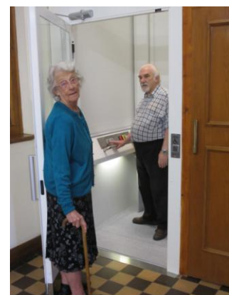
Lift to provide access for all

A new meeting room, the Gallery, has been created in a little-used first floor space. It can accommodate up to 40 people, and has lift access for people with mobility problems.