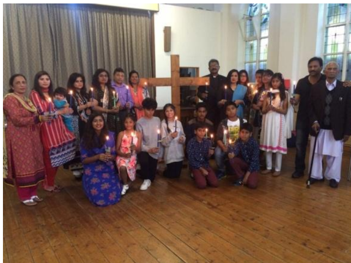
Asian Christian Fellowship, Swansea

In Wales, there is a specific website for the Methodist Church in Wales/Yr Eglwys Fethodistaidd yng Nghrymu, with pertinent advice and news for the Wales Synod. www.methodistwales.org.uk