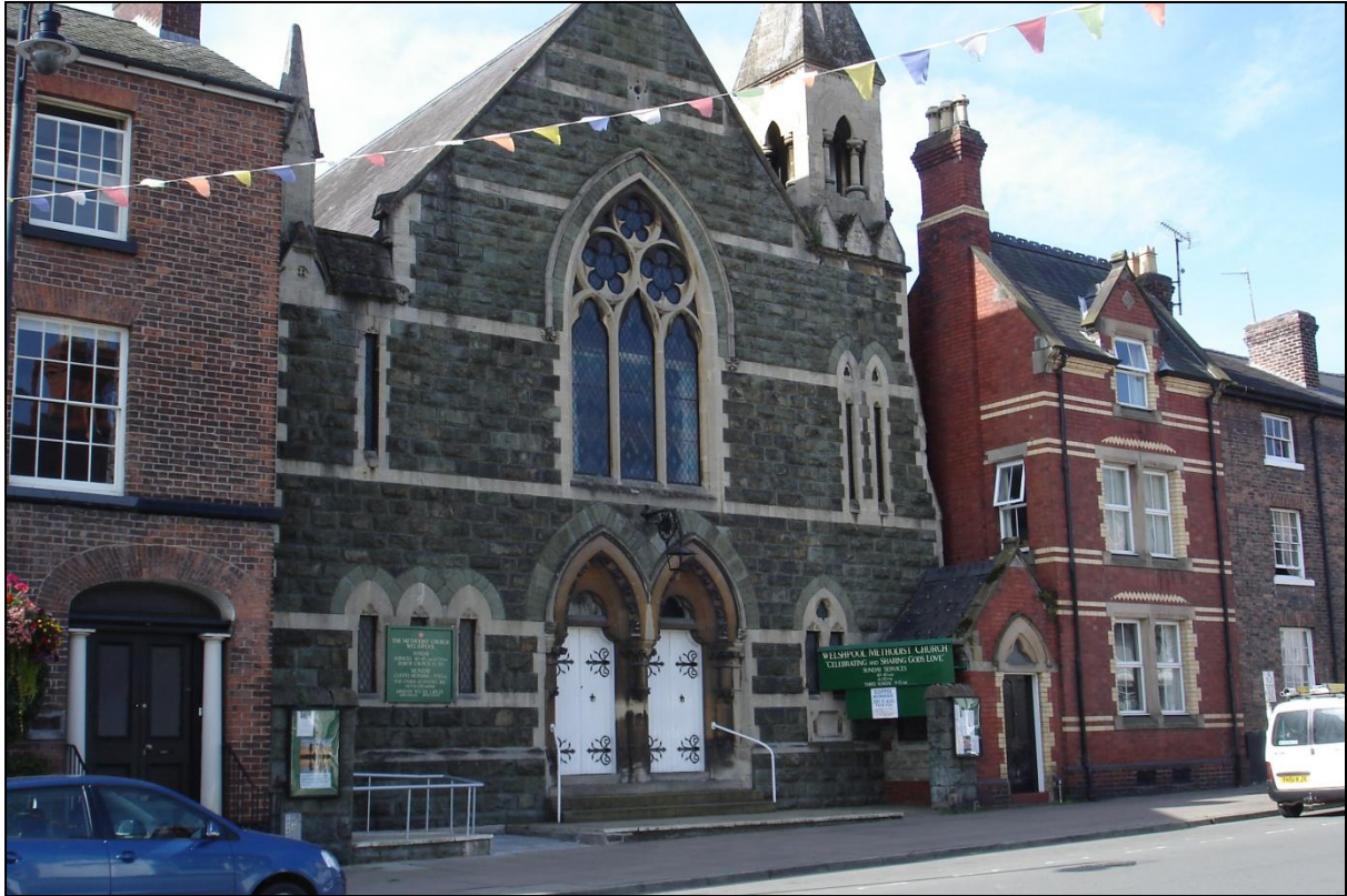
Welshpool Methodist Church

High Street Methodist Church, situated in a conservation area in the small market town of Welshpool in mid-Wales, has, throughout its 150-year history, had a reputation for welcoming both friends and strangers over its threshold.